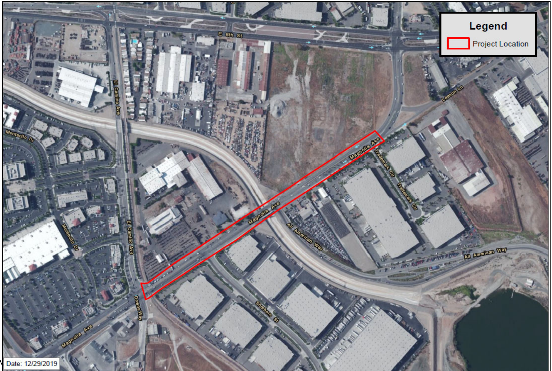
Figure 1 – Project Limits